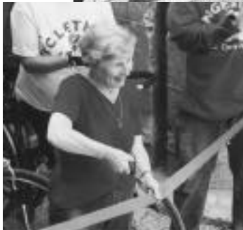
Hackney's Deputy Mayor snips the silk